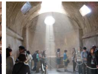
Baths at Pompeii