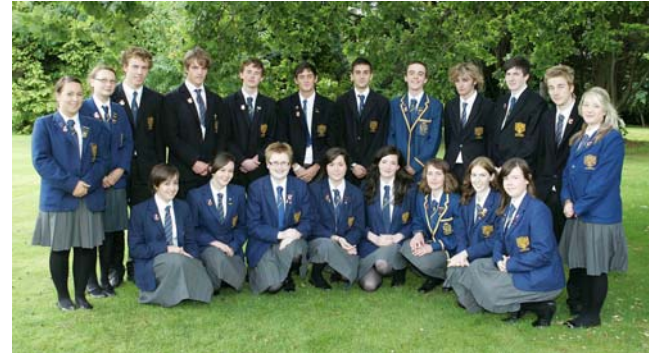
AS examinations - 73 A grades