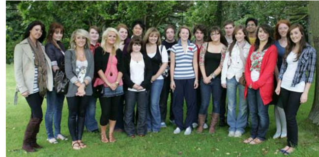
A2 examinations - 85 A grades