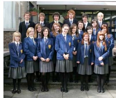
GCSE examinations - 91 A* and 94 A grades